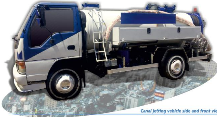
Canal jetting vehicle side and front view